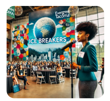
Visionaries present their projects in farming, food justice, and cooperative business models.